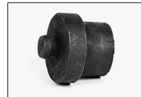
Fig. S112 — MOK Body Die

Dimensions and pressures for reference only, subject to change.